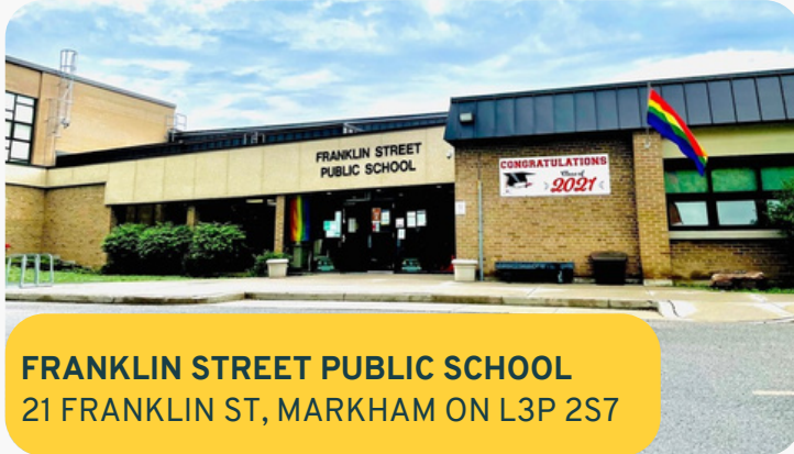
FRANKLIN STREET PUBLIC SCHOOL 21 FRANKLIN ST, MARKHAM ON L3P 2S7