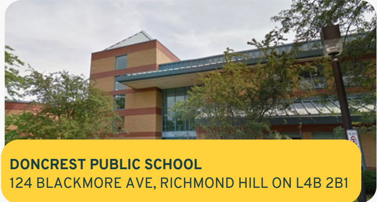
DONCREST PUBLIC SCHOOL 124 BLACKMORE AVE, RICHMOND HILL ON L4B 2B1

York Region Educational Services (YRES) is a registered non-profit organization. We offer every camper a free half-day camp.